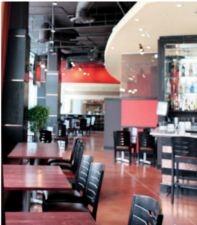
The bar at Varasano's Pizzeria leads directly into the main dining room with a view of the open kitchen.