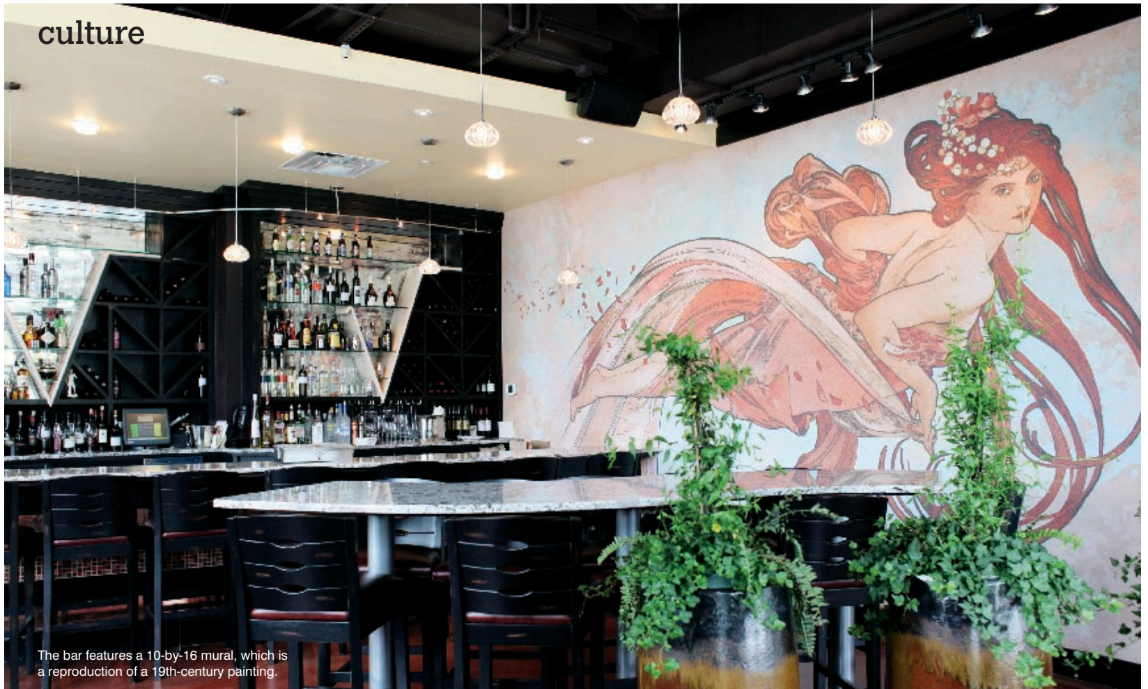
The bar features a 10-by-16 mural, which is a reproduction of a 19th-century painting.